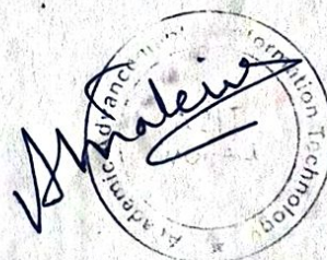
Registrar IET Bhaddal Technical Campus Ropar